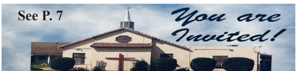
See P. 7

Enjoy writing? Want to learn a skill set that could translate to making you, "future-proof"? The Highgrove Happenings Newspaper is looking for young interns to learn writing, marketing and modern skill-sets to benefit our community and youth.