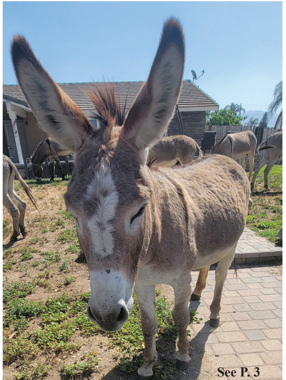
See P. 3

"Epigenetics literally means 'above' or 'on top of' genetics. It refers to external modifications to DNA that turn genes 'on' or 'off'. These modifications do not change the DNA sequence, but instead, they affect how cells 'read' genes." -- Livescience.com